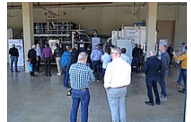
Future topic: The demonstration plant at the Grevenmacher WWTP consists of a HUBER Pile Cloth Media Filter RotaFilt®, ozonation and activated carbon adsorption.

Further information on advanced wastewater treatment can be found here at our website.