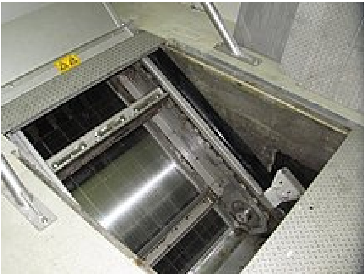
Due to the extremely flat installation of the bar rack the screen section through which the flow passes is always double the water level in the channel.