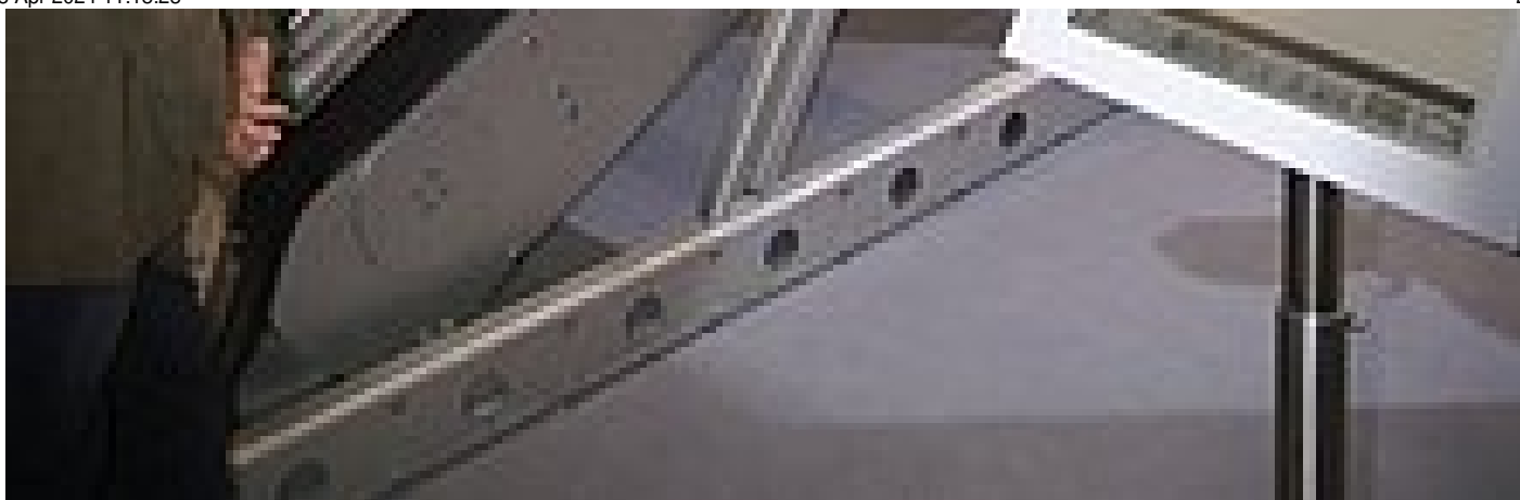
The prototype of the L-shaped RakeMax@hf screen was for the first shown at IFAT 2010.