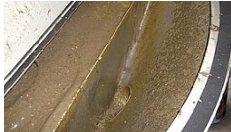
... of removed grit and returned to the flow