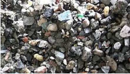
Grit, glass, and bone removed from the grit washer

The removal of the grit and glass will dramatically improve the plants performance and reliability.