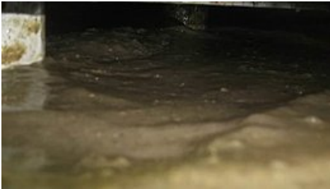
Organic material washed out ...