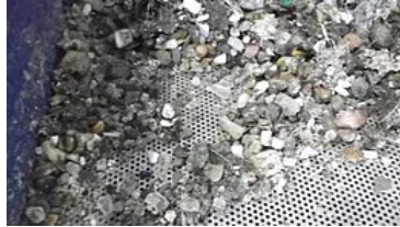
Sieved material removed from grit washer