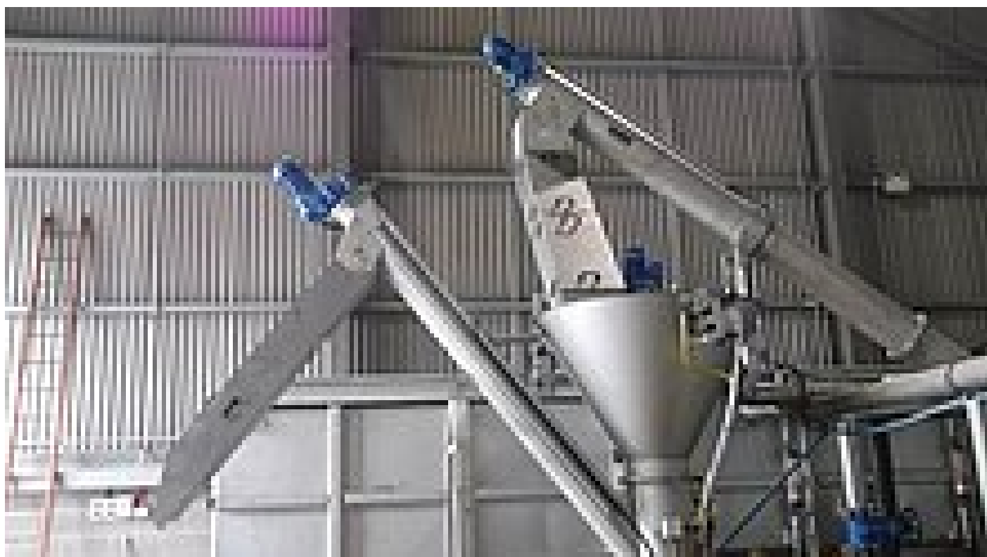
Grit washer was elevated so that the overflow drained back to the grit trap

An existing anaerobic digestion plant in Northern Ireland takes in a mixture of food waste and green waste. In order to reduce the