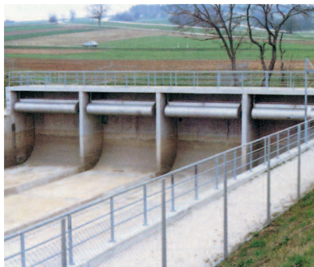
Stormwater holding sewer with integrated chamber for installation of tipping buckets