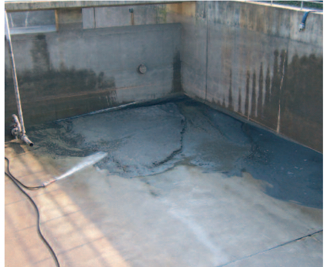
Labour-intensive, manual tank cleaning

Tipping buckets are arranged on the tank side opposite to the sump. They consist of a trough that takes up the medium and is supported outside the axis of rotation. During the filling process a torque is generated as the filling level in the trough increases, which effects automatic tipping of the bucket when the trough is completely filled. During the tipping action the flush water is diverted by a concrete radius at the tank bottom from the vertical into horizontal direction. When the tipping bucket is empty, it automatically returns into its home position and is available for the next flushing sequence.