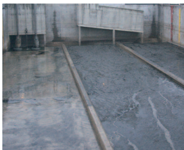
Efficient removal of sediments with tipping buckets