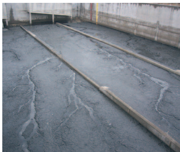
Sediments in the stormwater tank after an impoundage event