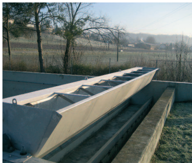
HUBER Tipping Bucket supported on the tank rims