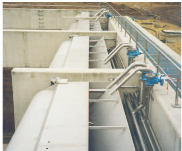
Tipping buckets with flushing medium supply