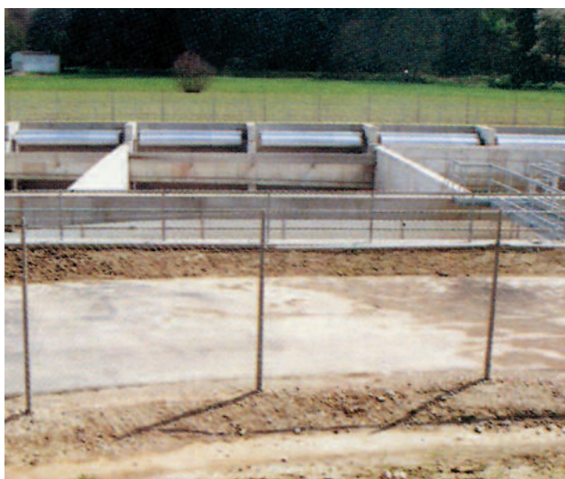
Stormwater holding sewer with integrated chamber for installation of tipping buckets