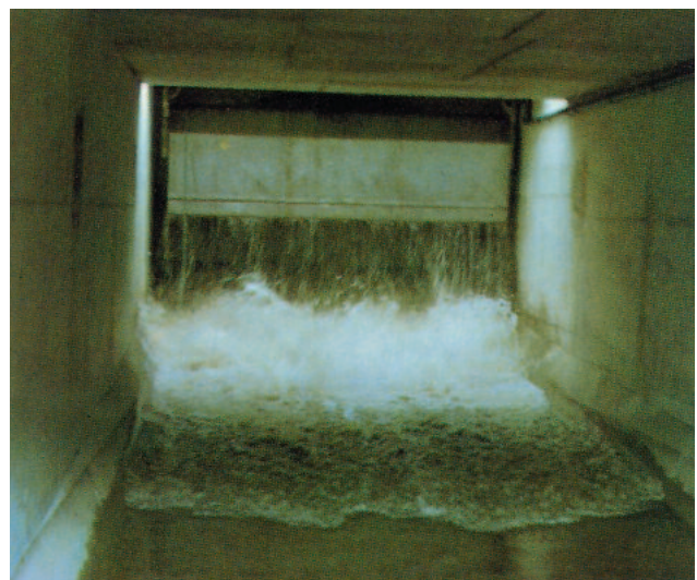
Tipping action in a covered structure