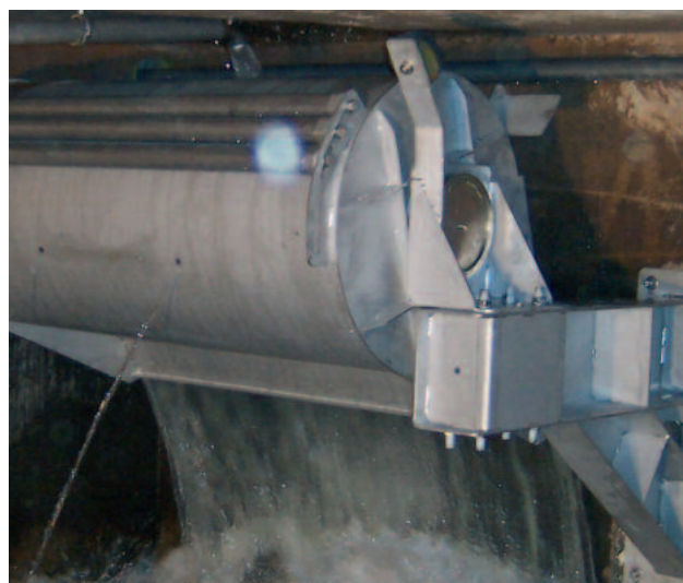
Tipping action in a covered structure